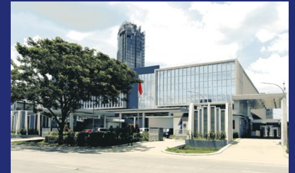
Over 3,600 m 2 in size, the Bank Central Asia's new cash center comprises digitally connected hardware, software, and control systems, plus storage capacity for 120 million banknotes

Contact our experts for a personalized consultation today!