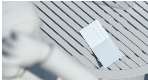
Customer notices their card is missing.