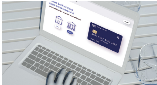
New customer signs up online and chooses instant card issuance.