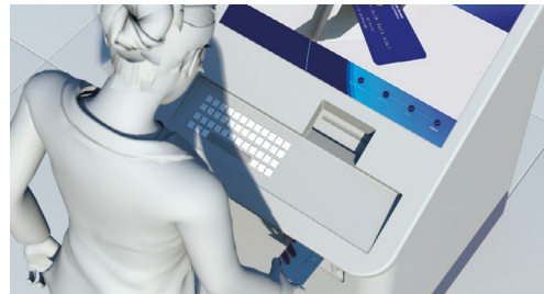
Visits self-service kiosk and receives replacement card in minutes.