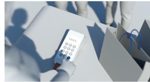
Delighted with process, begins spending straight away.