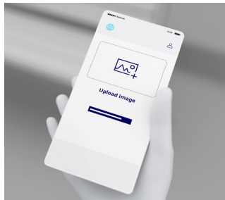
User then uploads their own photograph