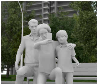
User shoots a picture on their smartphone