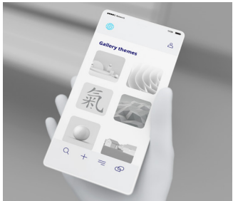
or they can also select card image from gallery