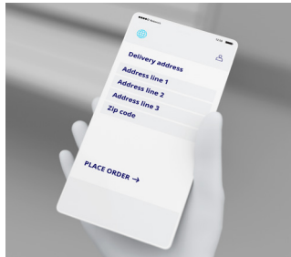
User orders the card to preferred address