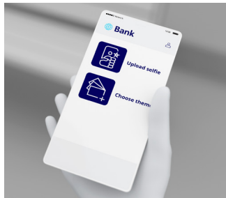
User selects "design own card" option